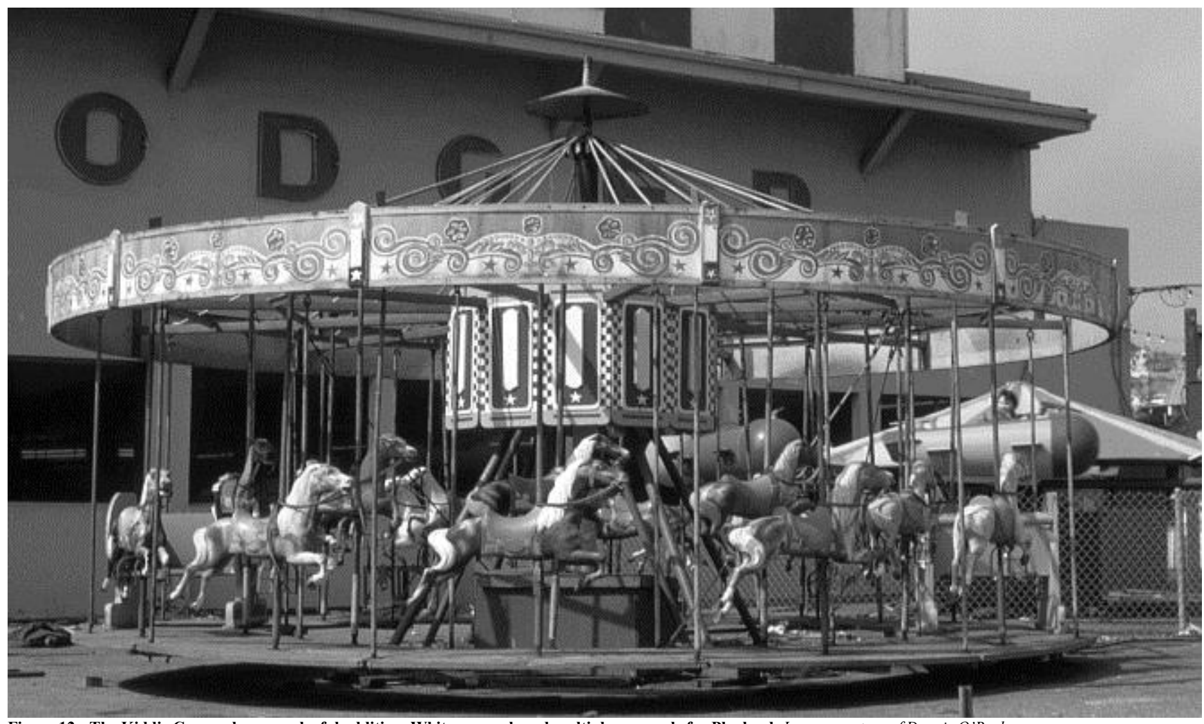
Figure 12 - The Kiddie Carousel was a colorful addition. Whitney purchased multiple carousels for Playland.