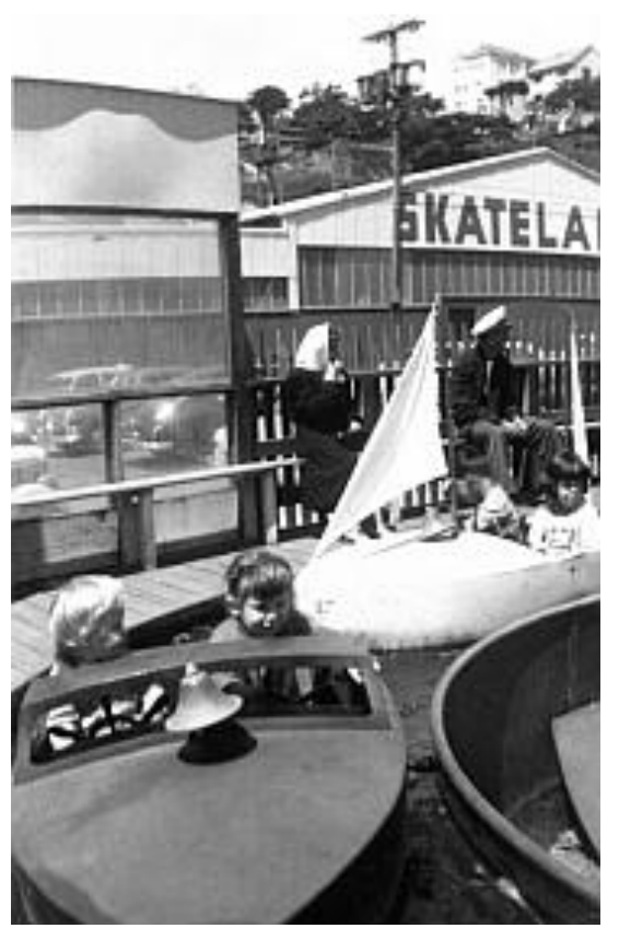
Figure 2 - Kids favored the speed boats. No sail and you know they went faster.