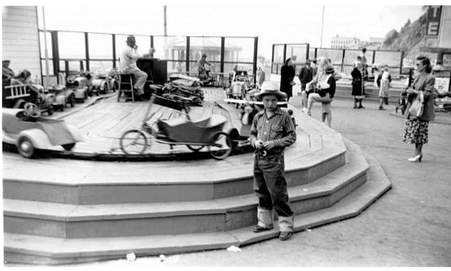
Figure 1 - This cowboy is ready for another ride.