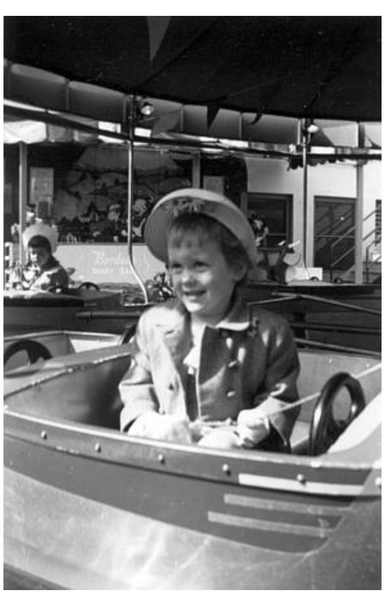
Figure 3 - . . . and they also provided a great photo opportunity to show off your finest.

and created that new draw he wanted. They remained there until select rides relocated to Fun-Tier Town in 1960.