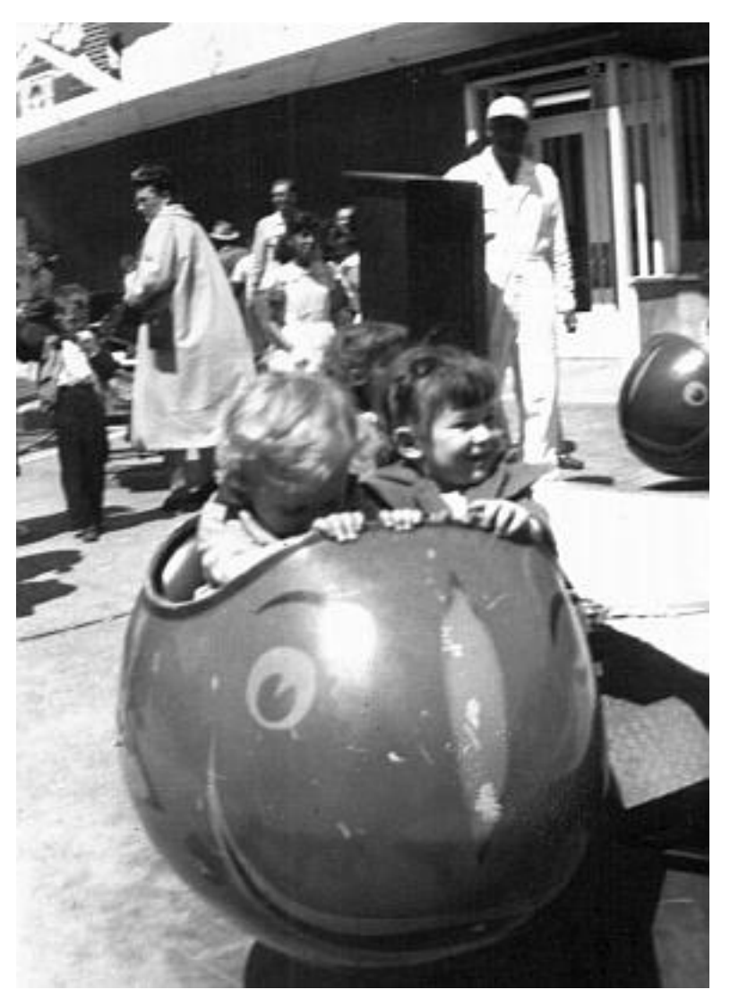
Figure 4- Bubbles the Whale was a fun up & down ride. He made the cut to Fun-Tier Town.