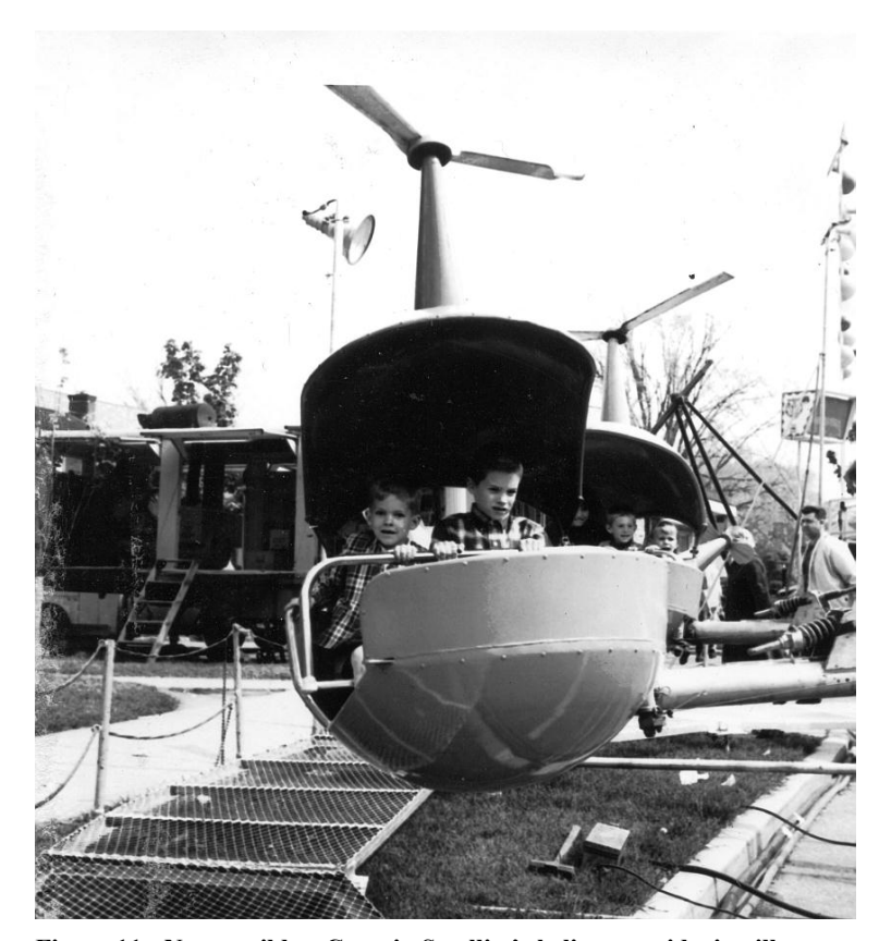
Figure 11 - Not as wild as Captain Satellite's helicopter ride, it still got the job done. This ride also went on to Fun-Tier Town.