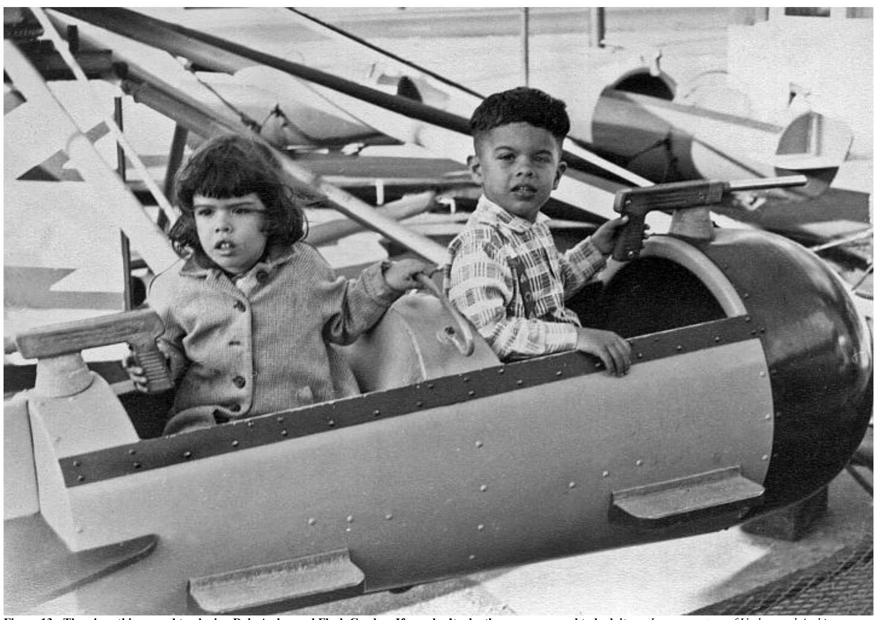
Figure 13 - There's nothing equal to playing Dale Arden and Flash Gordon. If you don't who they are, you need to look it up.