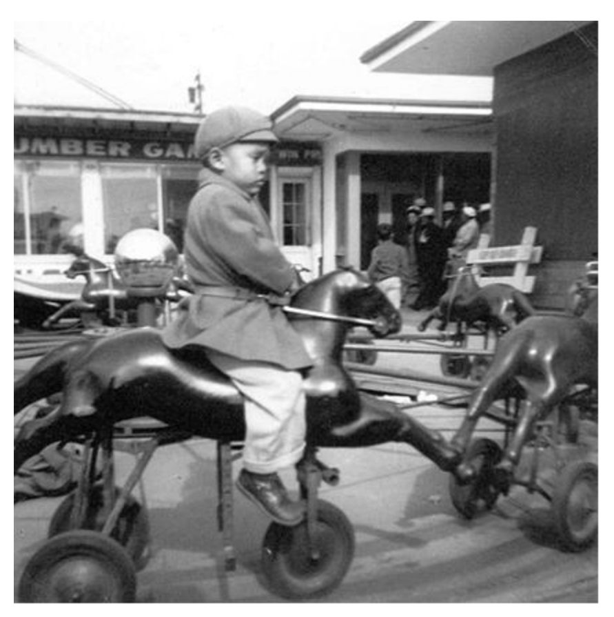
Figure 10 - Riding this early kiddie carousel was serious business.