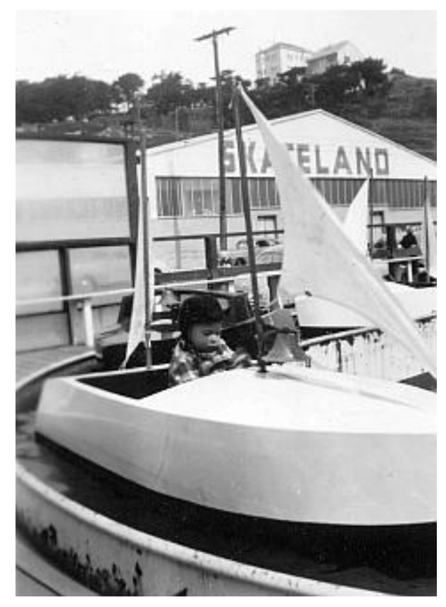
Figure 1 - The boat rides were a kid favorite. They were slow, safe and seemed to do something.

Kiddie Rides offered a largely untapped market after World War II. Realizing the trend, in 1950, Whitney moved his small assortment to the space left by the removal of the Shoot the Chutes and the Tumble Bug on Balboa off the Great Highway. These flat rides were cheap to install