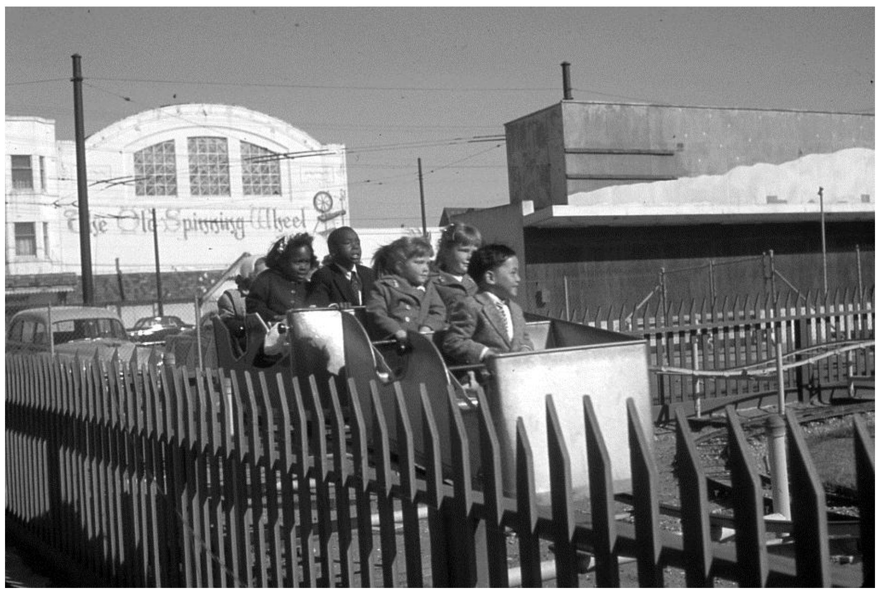
Figure 9 - The Kiddie Coaster actually Offered some thrills. It was comparatively fast and had some decent banks and turns.