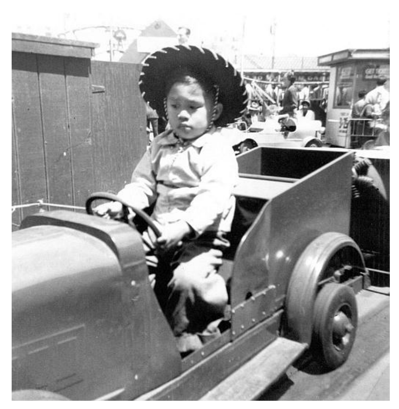
Figure 8 - This young man is having the time of his life. Really!